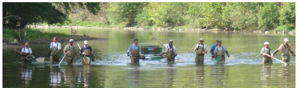
Barge electroshocking for smallmouth bass in Conococheague Creek