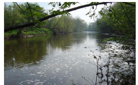
Monocacy River below wastewater treatment plant outfall.

dalvarez@usgs.gov Vicki_blazer@usgs.gov Chris_Guy@fws.gov liwanowicz@usgs.gov JMullican@dnr.state.md.us Fred_Pinkney@fws.gov