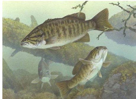
Smallmouth bass.

To gain a greater understanding of the reproductive health of bass and the implications to the ecosystem in the Northeast U.S., sampling of fish from rivers near National Wildlife Refuges (from Virginia north to Maine) using a similar upstream/downstream design is ongoing. Further sampling is also being conducted in the mainstream upper Potomac River and in the tidal area downriver of Washington, DC.